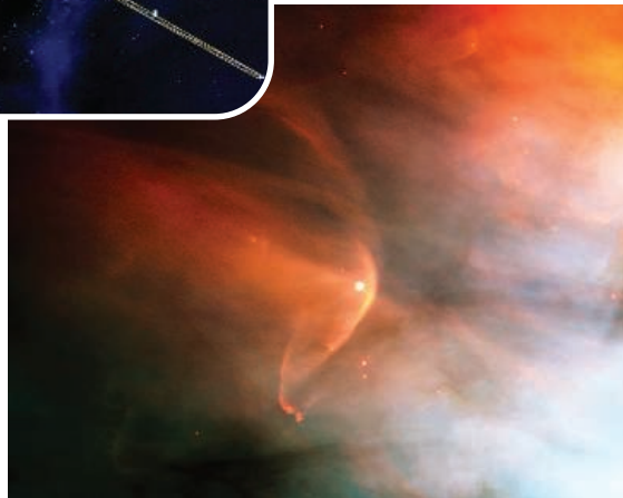
Outward bound. Voyager 1 has entered the outer reaches of the sun's realm, which resembles this region around the star LL Ori.