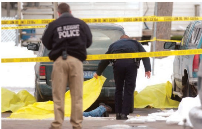
Violence debate. A study of Chicago adolescents indicates that seeing a murder may lead to later gun violence by the observer.